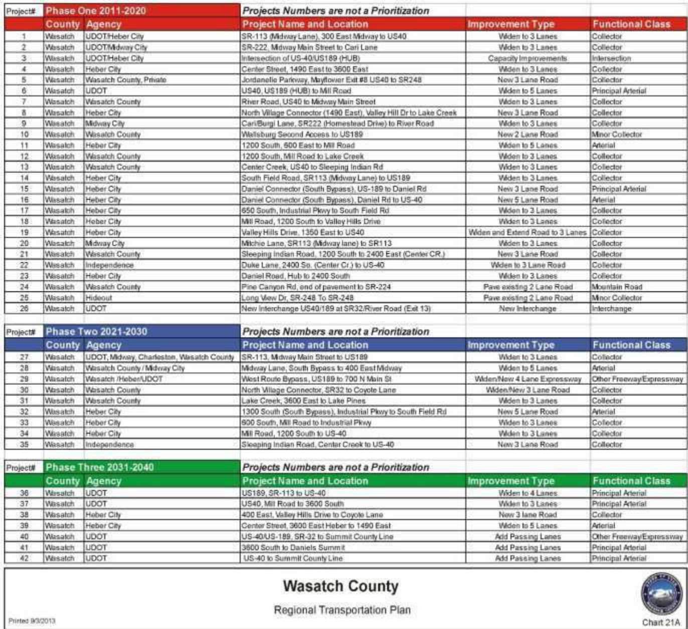
Chart 21A Regional Transportation Projects Plan 2011-2040